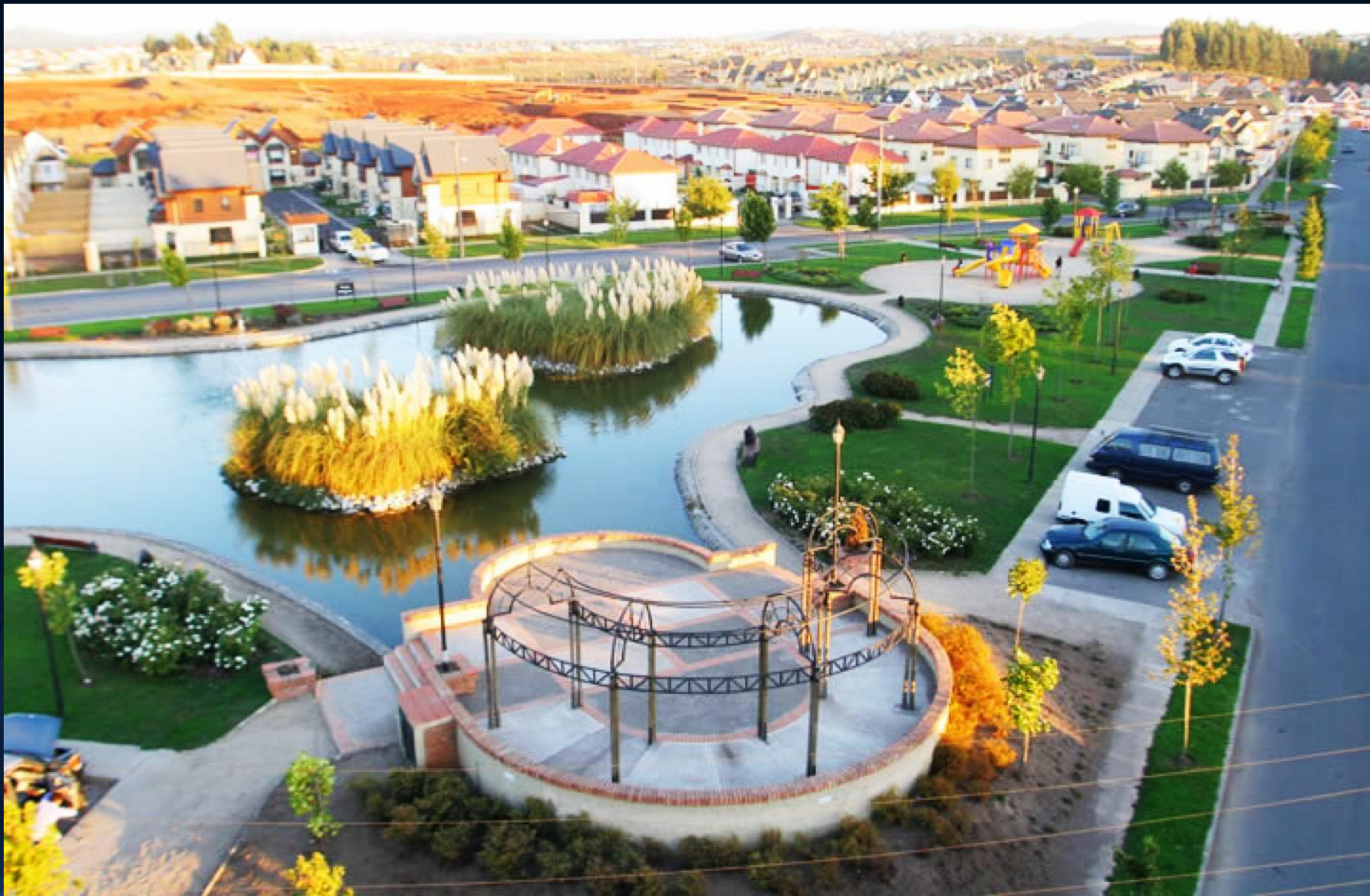
Plaza Belgica en Concepción, Chile